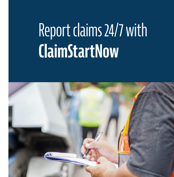
Get started at the Insured Portal MyGreatAmerican.gaig.com

Questions about your login? Contact FNOLApp.Support@gaig.com.